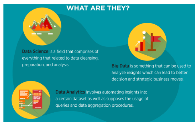
Fig. 1: Comparison between Data Science, Big Data and Data Analytics [5]

also be delivered by data analytics based on social media data.